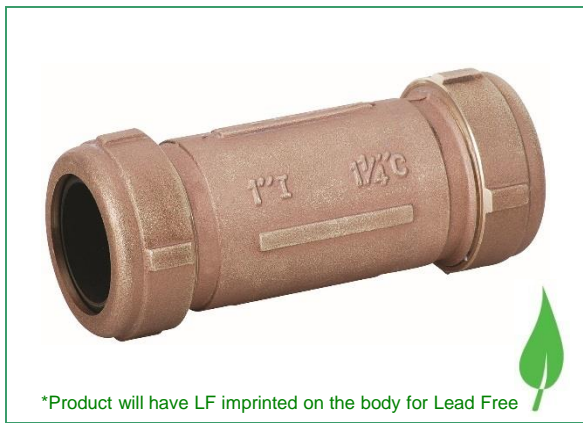
*Product will have LF imprinted on the body for Lead Free