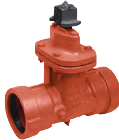
10RT Ring Tite Cast Iron Gate Valve Sizes from 2" to 8"