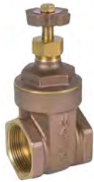
514TX Brass Gate Valve X Handle Sizes from 1/4" to 4"