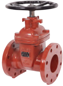
225W AWWA C515 Ductile Iron Flanged Valve Sizes from 2" to 24"