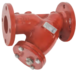
140EF UL Epoxy Coated Cast Iron Flanged Y Strainer Sizes 2-1/2" to 12"