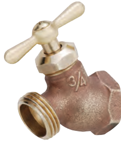
207TF Hose Bibb No Kink Sizes Hose x MIP or FIP 1/2" & 3/4"