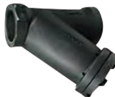
140S Cast Iron Threaded Y Strainer Sizes from 1/2" to 2" 20 Mesh S.S. Screen Sizes from 2-1/2" to 3" 3/64 Perforated S.S. Screen