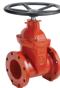
200WW Ductile Iron Flanged Gate Valve - AWWA EPDM Wedge Sizes from 2" to 12"