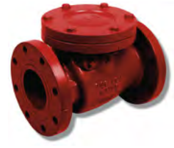
120F Cast Iron Flanged Check Valve Sizes from 2" to 12"