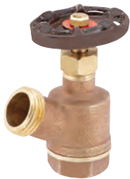
203IF Inverted Nose Garden Valve Sizes Hose x 3/4" FIP