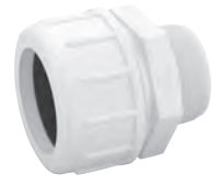
420T PVC Adapter Male X Compression Sizes from 1/2" to 2"