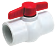
770N PVC White Ball Valve Economy Pattern Solvent and Threaded Sizes from 1/2" to 4" and 6"