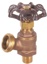
205CM Boiler Drain with Stuffing Box Male Copper Sweat Sizes 1/2" Male Copper Sweat