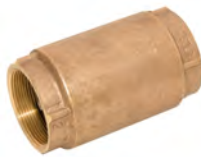
525 Brass Inline Check Valve Sizes from 1/2" to 2"