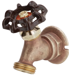
206T Sillcock Brass Body Sizes 1/2" & 3/4"