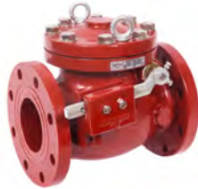
120WC Ductile Iron Flanged Check Valve with Outside Lever & Weight AWWA Sizes from 3" to 16"