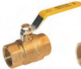
759 Ball Valve Full Port Forged Brass CSA Certified Sizes from 1/4" to 4"