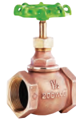
200TLF Lead Free Globe Valve Sizes from 3/8" to 2"