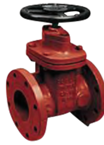
10RW Flanged Cast Iron Gate Valve Sizes from 2" to 12"