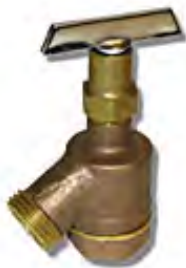
203TL Brass Loose Key Garden Valve Sizes from 1/2" to 1"