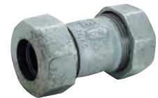
440TC Malleable Compression Coupling Galvanized Short Sizes from 1/2" to 4"