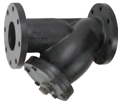
140F Cast Iron Flanged Y Strainer Sizes from 2" to 12"