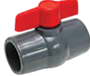
770G PVC Ball Valve Schedule 80 Solvent and Threaded Sizes from 1/2" to 4"