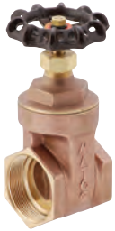
514 Gate Valve Brass Sizes from 1/4" to 4"