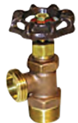
205TM Boiler Drain with Stuffing Box Sizes 1/2" & 3/4" MIP