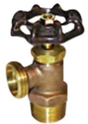
204TM Boiler Drain Less Stuffing Box MIP Sizes Hose x MIP 1/2" & 3/4"