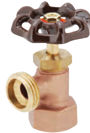
205TF Boiler Drain with Stuffing Box Sizes 1/2" & 3/4" FIP