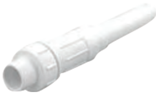
460T PVC Expandable Repair Coupling Sizes from 1/2" to 4"