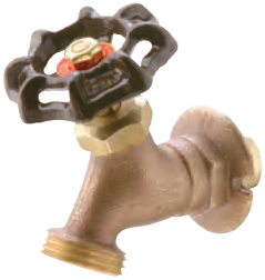
206C Sillcock Brass Body Sizes 1/2" & 3/4"