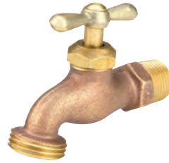
646R Hose Bibb Cast Brass Sizes Hose x MIP 3/8" - 1" 1/2" MIP x 1/2" Solder Inlet