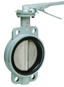
B5-RLOSE Butterfly Valve Wafer Style Lever Operated 316 Stainless Steel Disc EPDM Liner Sizes from 2" to 12"