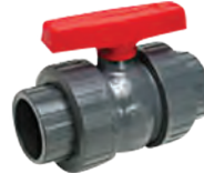
772ST PVC Ball Valve True Union Solvent and Threaded Sizes from 1/2" to 2"