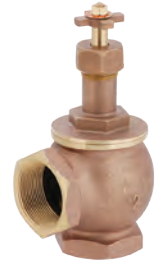
240T Brass Angle Globe Valve Cross Handle Sizes from 3/4" to 2"