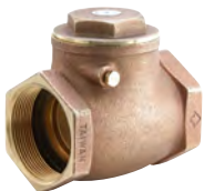
521 Brass Check Valve Threaded & Sweat Sizes 3/8" to 4"