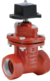
10RS_N Threaded Cast Iron Gate Valve Op Nut Sizes from 2" to 4"