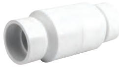
523S PVC SxS Inline Check Valve with SS Spring Sizes from 1/2" to 2"