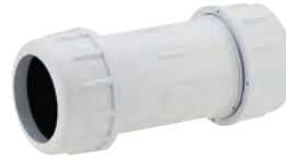
400T PVC Compression Coupling Sizes from 1/2" - 4"