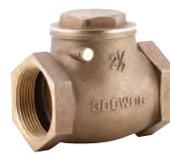
530LF Bronze Check Valve Sizes from 3/8" to 2"