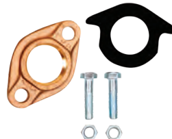
431T-SPLF Single Lead Free Brass Water Meter Flange & Flange Kits Sizes 1-1/2" & 2"