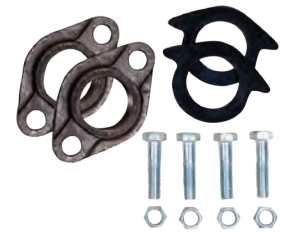
432T-P Double Cast Iron Meter Flange Kit Sizes 1-1/2" & 2"