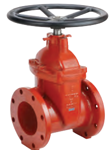
200WD Ductile Iron Flanged Gate Valve - AWWA BUNA-N Wedge Sizes from 6" to 16"