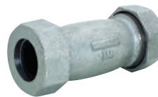
440LC Malleable Compression Coupling Galvanized Long Sizes from 3/8" to 3"