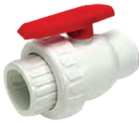
773 PVC Ball Valve Single Union Sizes 1-1/2" and 2"