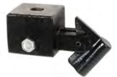
B5LCH B5 Latch Nut Sizes 2" - 6"