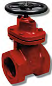
10RS Threaded Cast Iron Gate Valve Handwheel Sizes from 2" to 6"