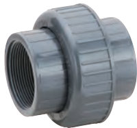
470 PVC Union Solvent Sizes from 1/2" to 4"