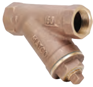
145 Y Strainer Bronze, with Brass Plug Sizes from 1/4" to 3"