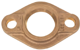
431T-LF Lead Free Brass Water Meter Flange & Flange Kits Sizes 1-1/2" & 2"