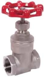
40SS Stainless Steel Threaded Gate Valve Sizes from 1/2" to 2"