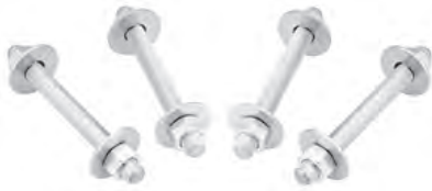
SBG Plated Stud Bolt, Nut and Washer Set Sizes from 2" to 16"