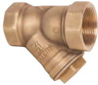
146LF Lead Free Y Strainer Brass Sizes from 1/2" to 2"