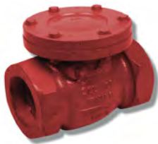
120S Cast Iron Threaded Check Valve Sizes 2" to 4"