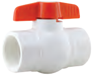
770 PVC White Ball Valve Solvent and Threaded Sizes from 1/2" to 4"