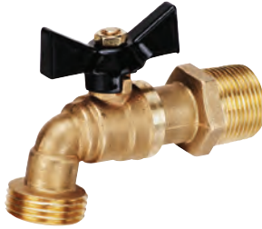
646BV Hose Bibb Forged Brass Sizes Hose x MIP 1/2" & 3/4" 1/2" MIP x 1/2" Solder Inlet