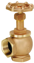
240TH Brass Angle Globe Valve Bronze Wheel Hand Sizes from 3/4" to 2"