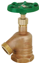
203TF Brass Bent Nose Garden Valve Sizes from 1/2" to 1"