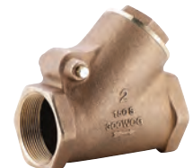
532 Bronze Check Valve Y Pattern Sizes from 1/2" to 2"