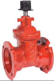
225M AWWA C515 Ductile Iron Mechanical Joint Valve Sizes from 2" to 24"