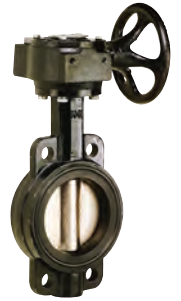
B5-RWG Butterfly Valve Wafer Style, Gear Operated Sizes from 2" to 36"