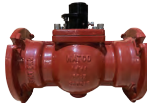
130M AWWA C517 Ductile Iron Mechanical Joint Eccentric Plug Valve Sizes from 3" to 12"