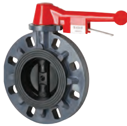
B1-RLO Butterfly Valve PVC Wafer Style Lever Operator Sizes from 2" to 6"