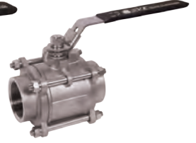
30SS Stainless Steel Threaded & Socket Weld Ball Valve Three Piece Sizes from 1/4" to 4"