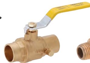
754D Ball Valve Full Port Forged Brass with Drain Sizes from 1/2" to 1"