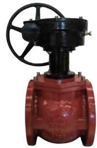
130W AWWA C517 Ductile Iron Flanged Eccentric Plug Valve Sizes from 3" to 12"