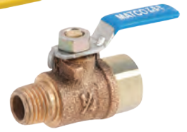
755MF Ball Valve Cast Bronze Male x Female Sizes from 1/8" to 1/4"