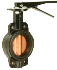
B5-RLOAB Butterfly Valve Wafer Style Lever Operated Aluminum-Bronze Disc BUNA-N Liner Sizes from 2" to 12"