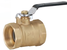
752N Ball Valve Standard Port Forged Brass Economy Pattern Sizes from 1/4" to 4"