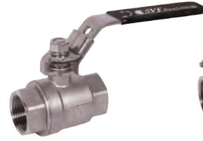
20SS Stainless Steel Threaded Ball Valve Two piece - Full Port Sizes from 1/4" to 3"