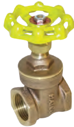
503 Bronze Gate Valve Sizes from 1/2" to 4"