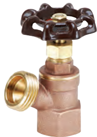
205F Full Flow Boiler Drain Angle Spout Sizes 1/2" & 3/4"