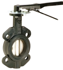
B5-RLO Butterfly Valve Wafer Style Lever Operated NP Ductile Disc BUNA-N Liner Sizes from 2" to 12"