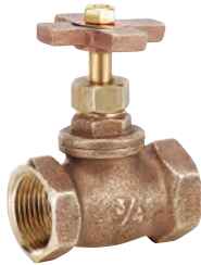
201X Brass Stop Valve with Cross Handle Sizes 1/2" & 3/4"