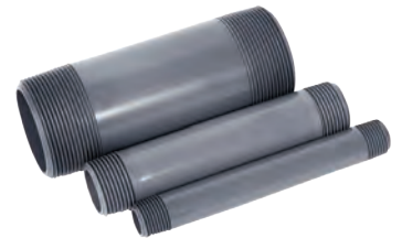
NPX Sch. 80 PVC Nipples Sizes 1/4" through 6" in diameter Available in long lengths up to 48"