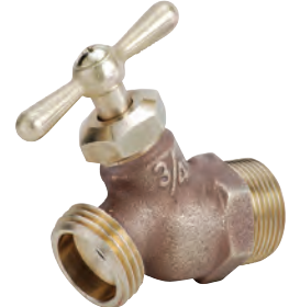
207TM Hose Bibb No Kink Sizes from 1/4" to 1/2"