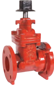
225FJ AWWA C515 Ductile Iron Flanged x MJ Valve Sizes from 3" to 12"