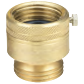
646AS Back Flow Preventer Sizes 3/4" Garden Hose Threads