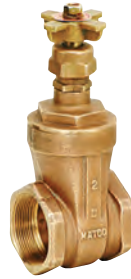
513TX Bronze Gate Valve Non Rising Stem H/W & Cross Handle Sizes from 3/4" to 3"