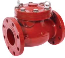
120W Ductile Iron Flanged Check Valve AWWA Sizes from 3" to 12"