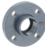
PVCF Sch. 80 PVC Van Stone Flanges Sizes 2" to 10"