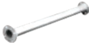
B5-X B5 Extensions Sizes 24" - 72"