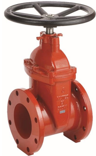
Valve comes standard with wheel handle. 2" Op Nut available upon request.